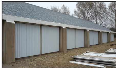
New Tabernacle doors

Each of these folks works very hard all year to prepare this sacred place for your use. Take some time and get to know all of us. We deeply appreciate the opportunity to serve the Lord and you in this work. We look forward to you coming back to Paisano. See you in a few months.